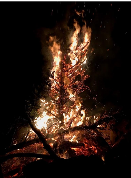
"Fire" by Zac Delagrange