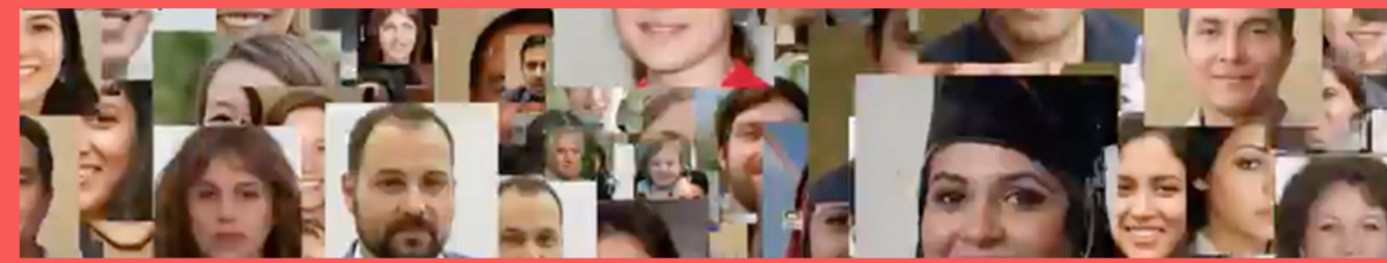
The Secretive Company That Might End Privacy as We Know It

https://www.nytimes.com/2019/07/26/technology/hong-kong-protests-facial-recognition-surveillance.html