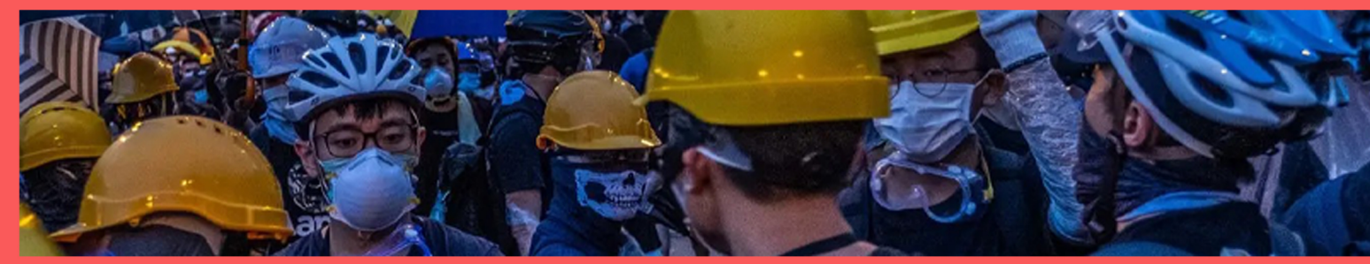
In Hong Kong Protests, Faces Become Weapons

https://www.nytimes.com/2019/07/26/technology/hong-kong-protests-facial-recognition-surveillance.html