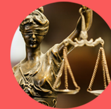
lack of legislation