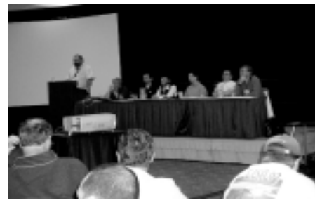
The Spam Mini-Symposium

The presenters believed that most spam is already covered by existing laws: fraud is already covered, as is trespass. New laws for other email will be expensive and difficult to pursue. In addition, the issues of free versus regulated speech versus privacy will be difficult to balance going forward. And the root of the issue is that spammers spam because people