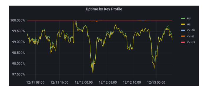
Figure 3: Uptime by policy; this shows that Portunus (v2) has consistently better uptime than Geo Key Manager (v1)

Table 3 shows the average time required to perform different key operations. Key generation refers to the process of generating attribute secret keys from the master secret key, which can be performed out-of-band of user handshakes and is therefore of marginal relevance in this context. Encryption latency can also largely be ignored, as it is acceptable for encryption to take a few extra cycles before a certificate is considered deployed. But once it is deployed, HTTPS requests to the website should complete quickly. Since decryption is in the critical path of every request, it is the most pertinent in our situation. While session resumption and caching policy keys can amortize the number of ABE decryptions across TLS handshakes to a small fraction, improvements to decryption latency will still affect overall baseline performance. It is therefore important to further optimize the decryption process.