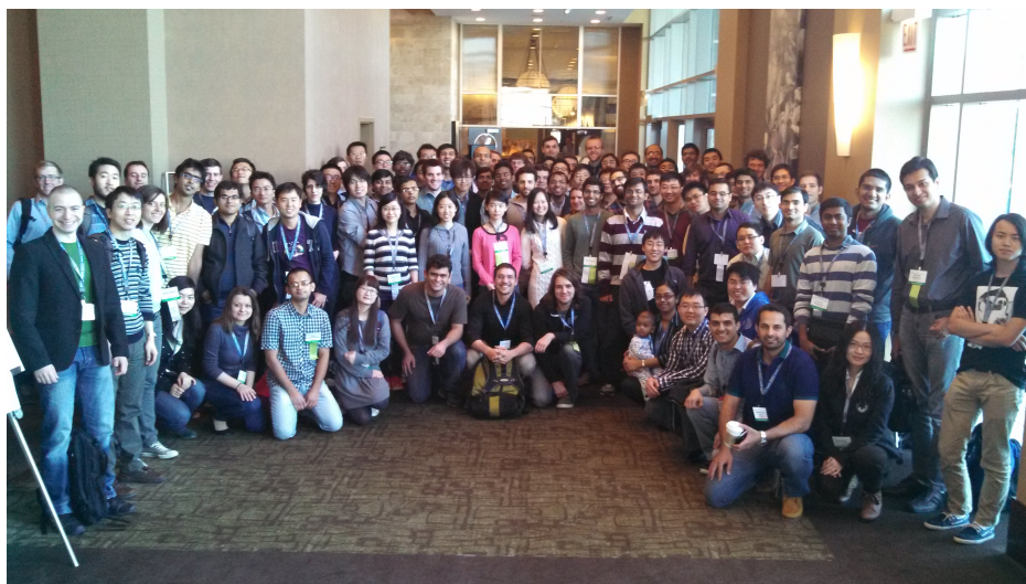
Some of our recent student attendees

* Symposium passes include access to the technical sessions, lunch, and evening activities, including reception.