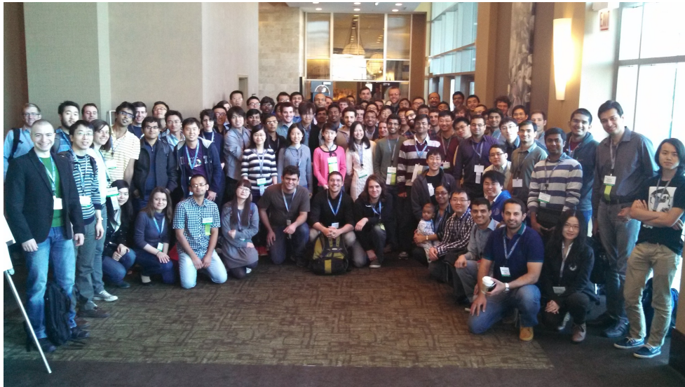
USENIX Conference Student Attendees