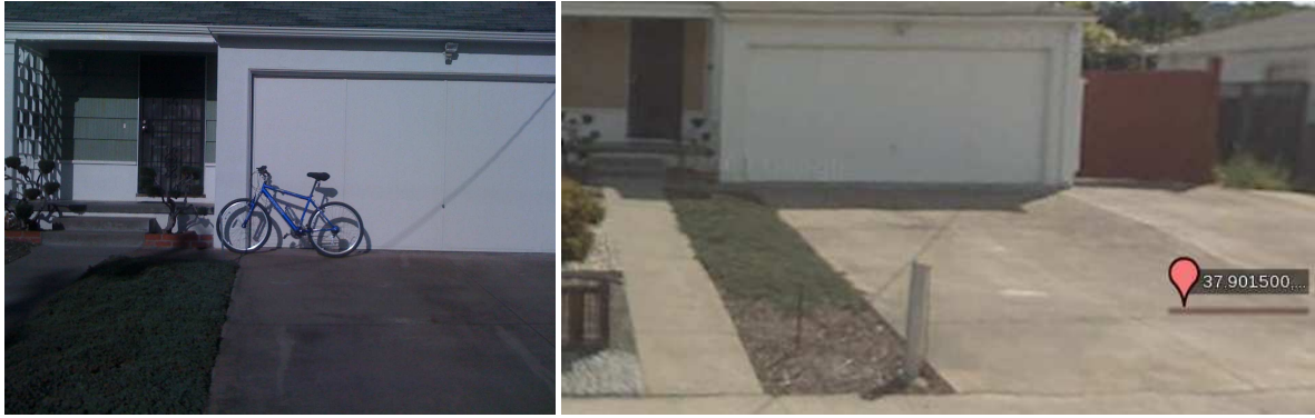
Figure 1: Photo of a bike taken with an iPhone 3G and a corresponding Google Street View image based on the stored geo-coordinates. The accuracy of the camera location (marked) in front of the garage is about \pm 1 m. Many classified advertisements come with photos of objects offered for sale, with geo-tags automatically added.

for burglars to break into their unoccupied homes. We wrote a script using the YouTube API that, given a home location, a radius, and a keyword, finds a set of matching videos. For all the videos found, the script then gathers the associated YouTube user names and downloads all videos that are a certain vacation distance away and have been uploaded the same week.