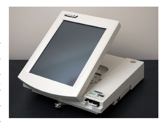
Figure 1: The Diebold AccuVote-TS voting machine

This paper reports on our study of an AccuVote-TS, which we obtained from a private party. We analyzed the machine's hardware and software, performed experiments on it, and considered whether real election practices would leave it suitably secure. We found that the machine is vulnerable to a number of extremely serious attacks that undermine the accuracy and credibility of the vote counts it produces.