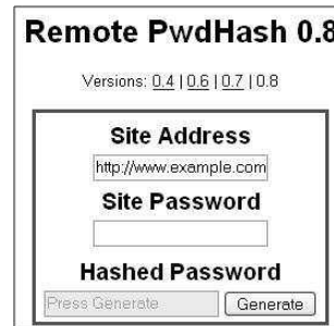
Figure 1: Remote web site for generating PwdHash passwords

Passwords are the most common form of authentication on computers today [23]; yet they are far from the most secure. Cognitive demands increase as people use more computer systems, leading to poorer password choices