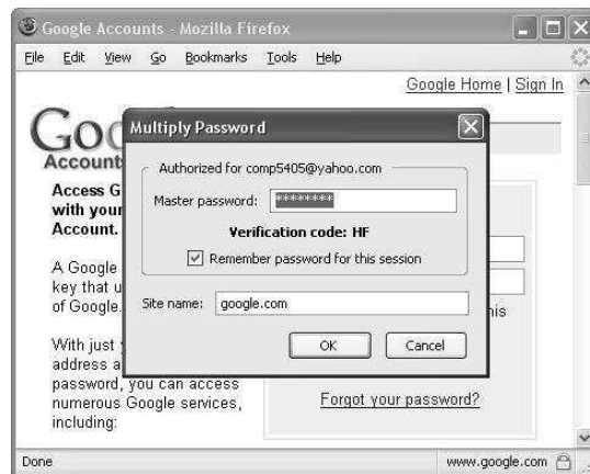
Figure 2: The dialog box for P-Multiplier is activated by double-clicking on the password field

Password Multiplier (hereafter identified as P-Multiplier) is a second password manager intended to help users generate strong passwords for web accounts [11]. It is a plug-in for Mozilla’s Firefox web browser, requiring no changes to the servers; all computation is done client-side. As with PwdHash, a cryptographic hash function is applied, generating strong passwords for the user’s accounts. While a primary design goal of PwdHash is to protect web site passwords against phishing attacks, P-Multiplier is intended to generate and manage strong passwords from a single user-chosen password for arbitrary password-protected applications (i.e., not restricted to web site passwords); this difference does not affect our usability study, and the plug-in we tested is restricted to web site passwords. P-Multiplier uses a master username and master password so that users need only remember one password for all of their accounts. A protected password is generated based on the master username, master password, and the target site domain name. Users activate the plug-in by double-clicking on the password field or pressing Alt+P while the cursor is in that field. This opens a small dialog box. The master username is entered automatically (it is set upon installation).