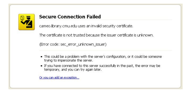
Figure 3: Screenshot of the initial FF3 warning.

The IE7 warning, shown in Figure 2(b), occupies the middle ground between the FF2 and FF3 warnings. It takes over the entire page and has no default option, but differs from the FF3 warning because it