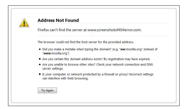
Figure 5: Screenshot of server not found error in FF3.

warnings have very similar layouts and coloring. The yellow Larry icon in the FF3 warning (Figure 3) and the first page of our multi-page (Figure 4(a)) warning is similar to the yellow triangle in Figure 5.