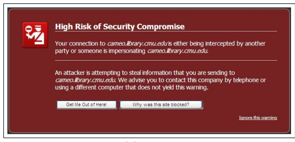
(b) Page 2