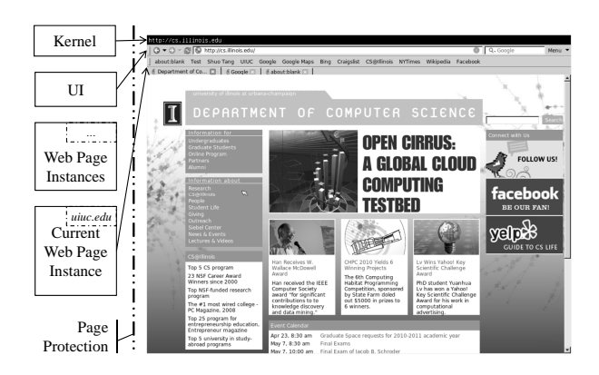
Figure 3: IBOS display isolation. This figure shows how IBOS divides the display into three main parts: a bar at the top for the kernel, a bar for browser chrome, and the rest for displaying web page content. The IBOS kernel enforces this isolation using page protections and without relying on a window manager.

write pixel values to this frame buffer and the graphics card displays these pixels. Although our mechanism makes heavy use of the software rastering available in Qt Framework[3], our experiences and anecdotal evidence from the Qt developers shows that software rastering can perform roughly as fast as native X drivers running on Linux [7]. The key advantage of our approach is that the IBOS kernel can use standard page-protection mechanisms to isolate portions of the screen. Although our current implementation does not support hardware acceleration, we believe that our techniques will work because the IBOS kernel can interpose on standardized acceleration hardware/software interfaces, such as OpenGL and DirectX.