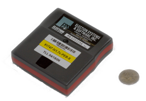
Figure 2: An ES&S "Personalized Electronic Ballot" (PEB) used to transport ballots and results between the iVotronic and Unity.