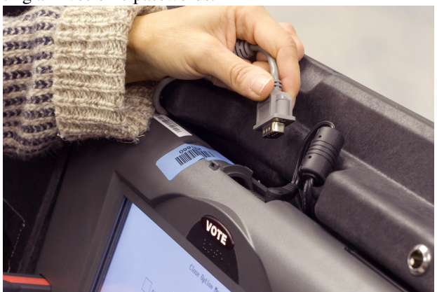
Figure 4: Unhindered access to printer connection allows disabling the iVotronic VVPAT audit log as well as the ability to print unauthorized data to the audit log.

pervasive deficiencies that give rise to the most serious vulnerabilities we found: ineffective access control, critical errors in input processing, ineffective protection of firmware and software and, ineffective cryptography and data authentication.