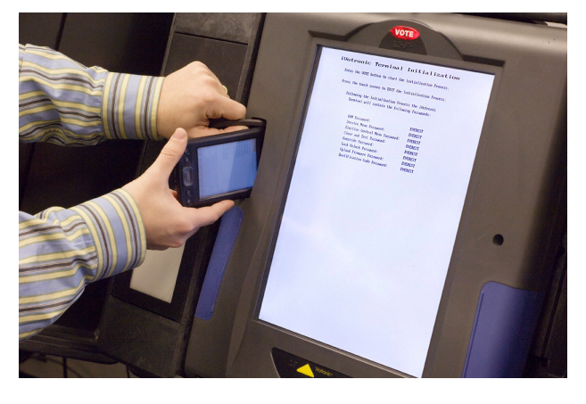
Figure 3: A PEB emulator running on a Palm device simulates an initialization PEB during an open election, resetting all iVotronic passwords.